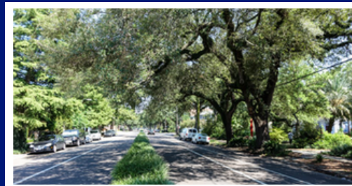
Tree lined street in New Orleans